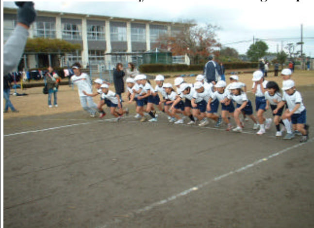
【3rd grade kids start】

The final event of the 2nd term was the Cross-Country Meet held on Friday, December 5. There were many parents and local community members rooting for the kids. Some new records were achieved as a result of running every morning. We also really appreciate everyone helping the children cross the streets