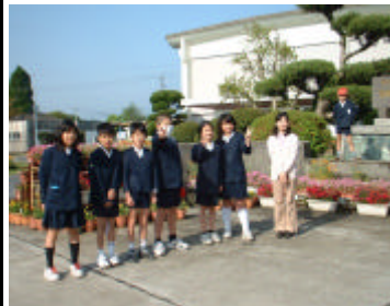
Greeting Campaign (Kids represent)

Stop Bullying Campain week was held from April 7, Mon. ~ April11,Fri. During that week, the students thought deeply about "Bullying" and how to stop bullying.